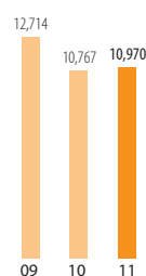
Net Sales (Millions of yen)

Despite ongoing harsh business conditions in the processed foods and health foods industries, in the fiscal year through March 2011 Nippon Shinyaku enjoyed growth in sales of health food ingredients, preservatives, and protein preparations.