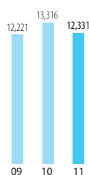
Net Sales (Millions of yen)

After Lunabell® was put on the market in July 2008 as a remedy for dysmenorrhea resulting from endometriosis, Japanese insurance programs covered its use and it achieved good market penetration. Since we obtained approval to list functional dysmenorrhea as an additional indication in December 2010, sales have been growing even more.