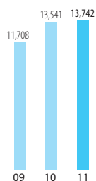
Net Sales (Millions of yen)

Eviprostat®, a remedy for benign prostatic hypertrophy, has been prescribed for many years, primarily by urologists. We began selling erectile dysfunction (ED) treatment Cialis® in July 2009, and sales have been growing.