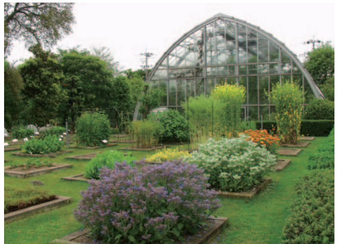
Yamashina Botanical Research Institute