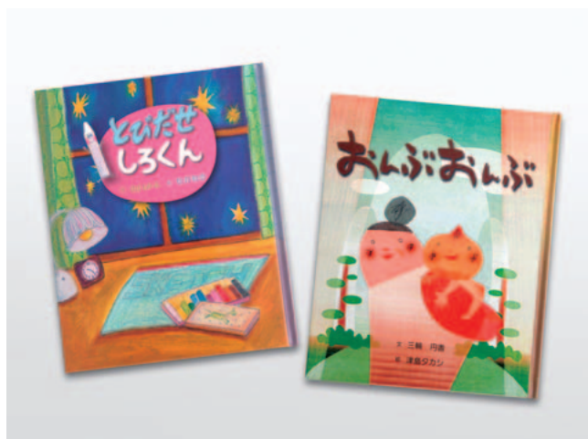
Anthologies of stories and pictures that won Nippon Shinyaku Children's Literary Awards