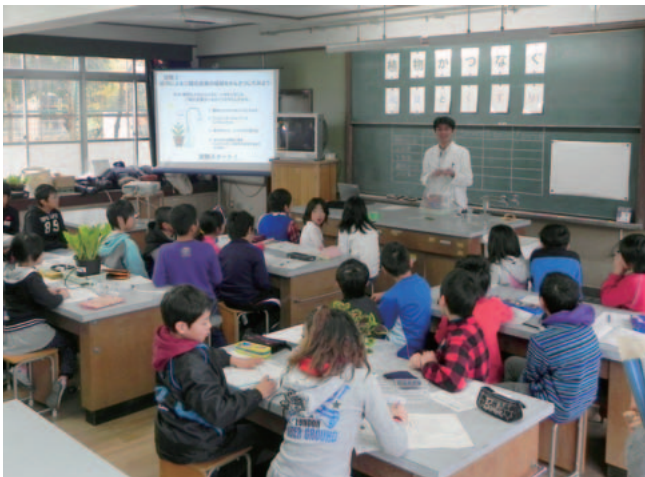
A Nippon Shinyaku employee teaches a class at a local school

Nippon Shinyaku's management is aware that the activities described above — taking care to preserve the earth's environment, continuously developing our pharmaceuticals and functional foods businesses, and actively engaging in other social contribution activities — constitute the fulfillment of the Company's social responsibilities. By pursuing our everyday business activities based on that awareness, we aim to meet society's expectations, earn the trust of the general public and be recognized as a company with a meaningful existence.